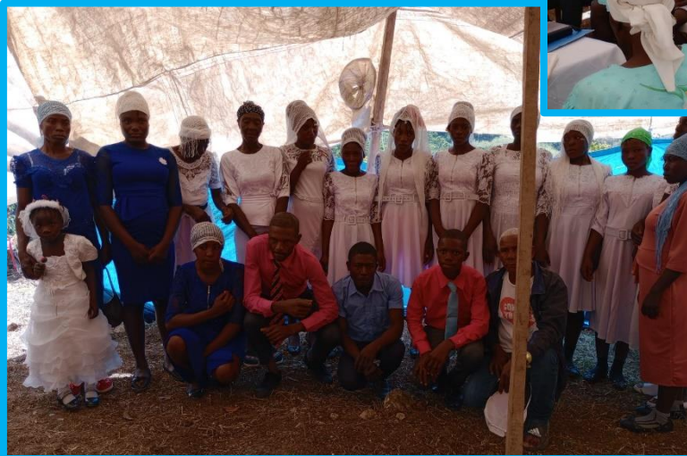
There were 18 baptisms (pictured left, after the baptisms).

We walked to the small water tank that is used as a baptistry, perhaps half a kilometer down the road (and then back up again!).